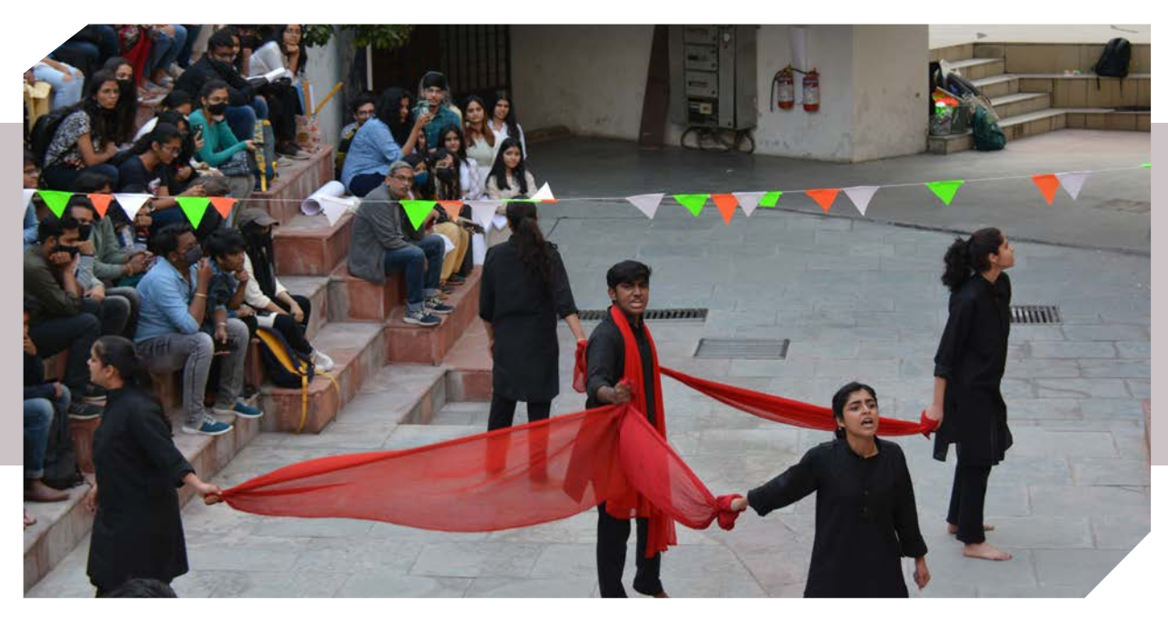
Student Development Programme

Student Development programme at all NIFT Campuses is initiated to encourage NIFT students to participate in physical, academic and artistic pursuits to make their education at NIFT campus more holistic and complete. Participation in these activities complement and facilitate their academic studies while providing ways to socialize, relax, have fun and be revitalized to face the day to day challenges.