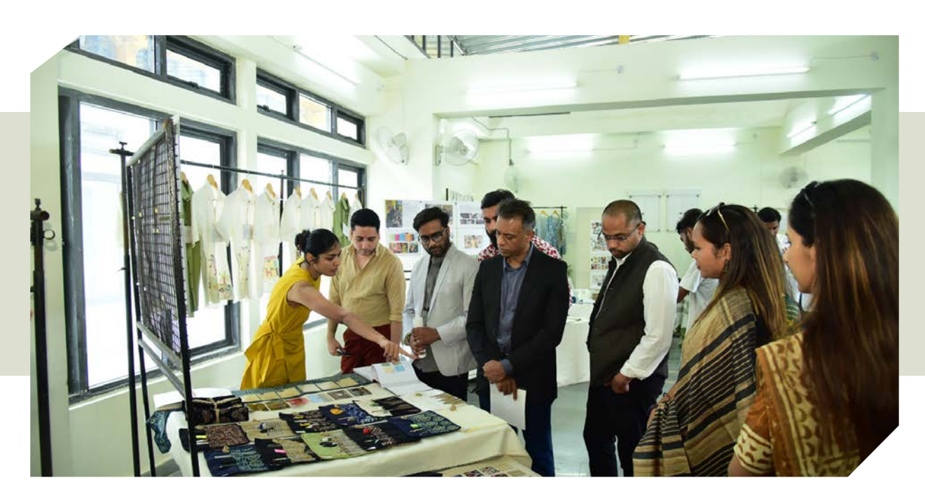
Significant Landmarks and Achievements of Campus