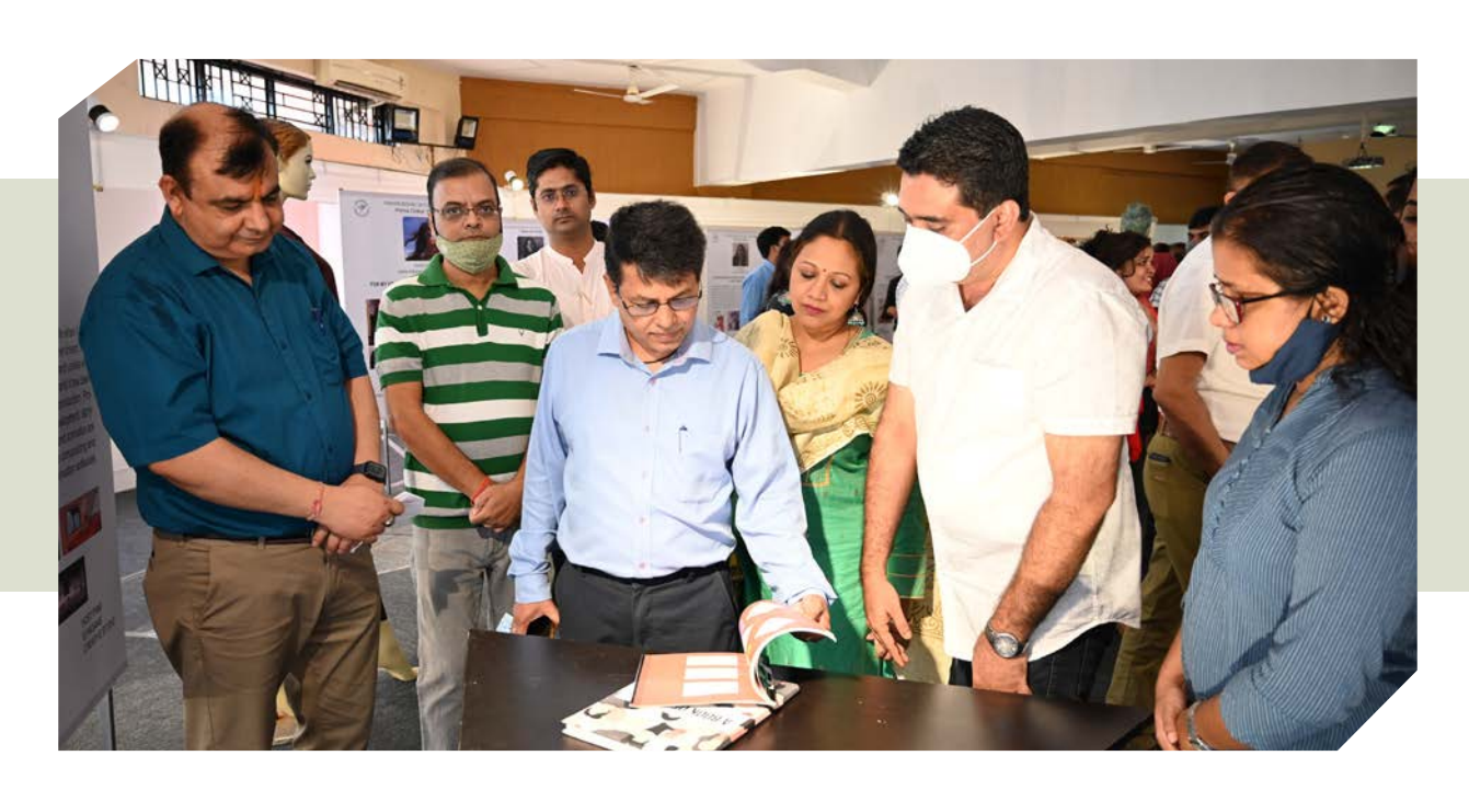
Significant landmarks/Major Achievements

Kannur, popularly referred to as 'Handloom City of Kerala,' is the state's largest handloom producing district. It enjoys global reputation in manufacturing and exporting handloom goods. NIFT Kannur centre situated 16 KM north of Kannur and 700 meters away from the National Highway.